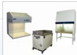
clean air products