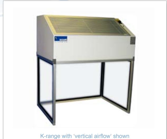
K-range with 'vertical airflow' shown

Each unit is available with a choice of airflow modes: